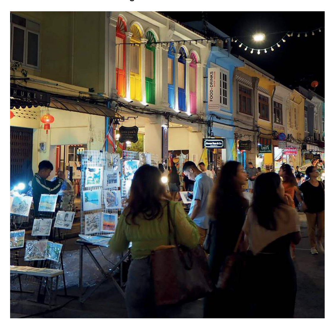
Fig. 5.1 for Question 5